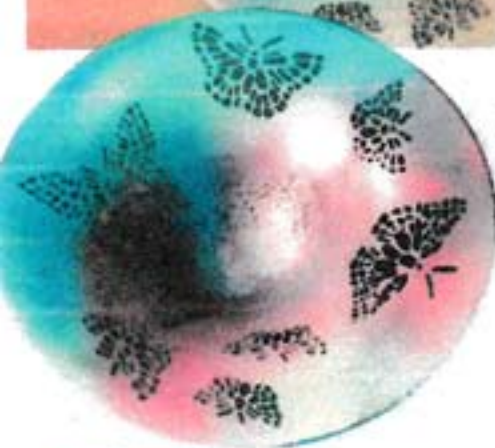
Inside of the finished butterfly bowl

2 Varnish with five or six thin coats of gloss varnish and hang them up to dry between coats, wet-and-dry sanding very lightly with 1500-grit abrasive