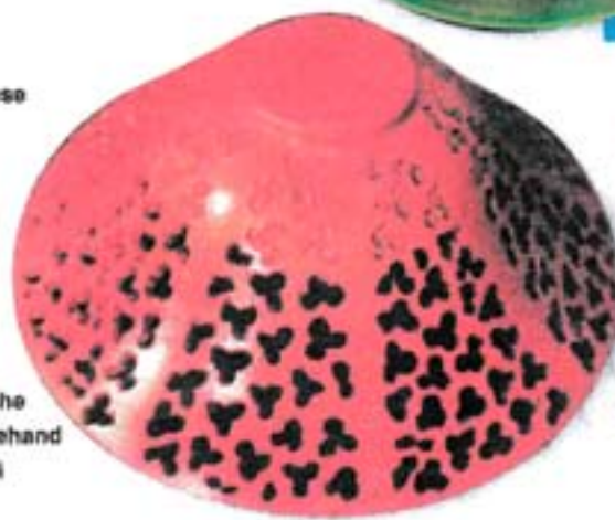
Outside of the finished freehand design bowl