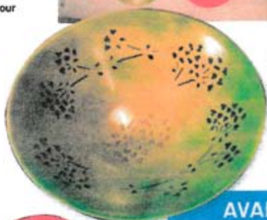
Inside of the finished flower bowl